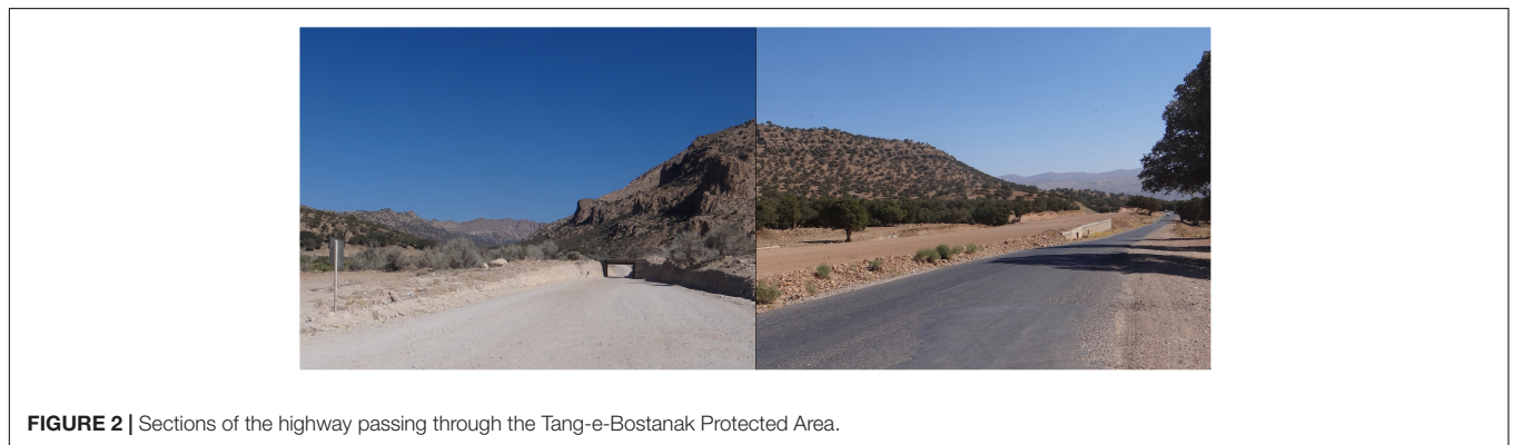
FIGURE 2 | Sections of the highway passing through the Tang-e-Bostanak Protected Area.