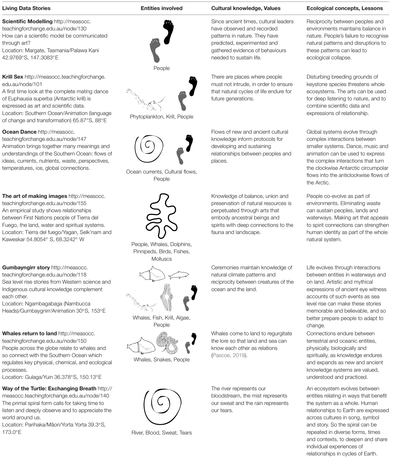
TABLE 1 | Stories conveyed through the interactive web-based map of MEASO Cultural Connections ( http://measocc.teachingforchange.edu.au/ ).