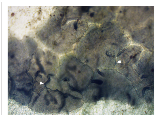
FIGURE 2 | Magnification of T. adhaerens aggregate on the aquarium wall biofilm. White arrowheads indicate the contact points between Placozoa. Magnification: 40X.

in multiple lines (Figure 1; Supplementary Videos 1, 2). The animals, especially the ones in the first lines, were tightly connected to one another (Figure 2). They were observed to be in physical contact with one another other along their margin, which slightly folds over in the ventro-dorsal direction (opposite to the substrate), forming stable but dynamic junctions (Figure 1; Supplementary Videos 1, 2). Occasionally, T. adhaerens would move to fill gaps in the chain of animals by binding themselves to neighbors on either side (Supplementary Video 3).