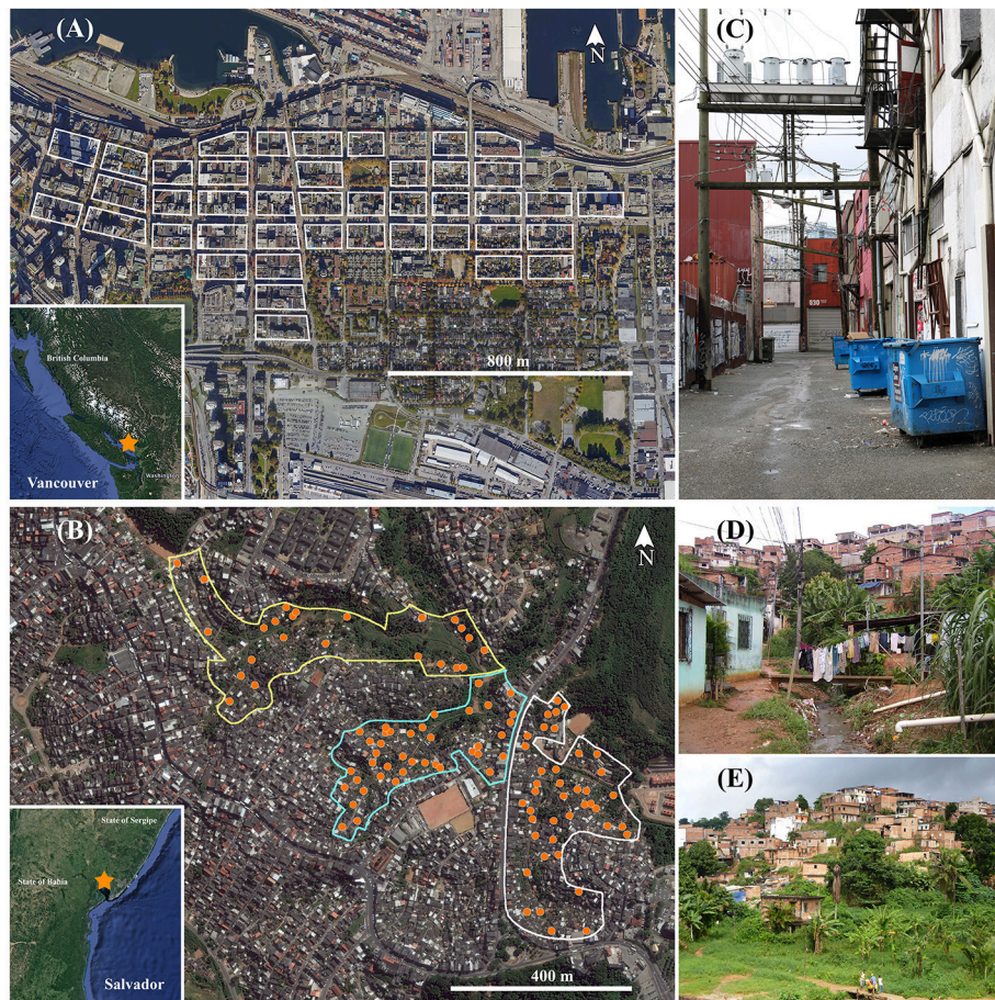
FIGURE 1 | Trapping locations in the 43 city blocks of Vancouver, Canada (A) and three valleys of Salvador, Brazil (B) . Examples of areas where rats were caught in each location are indicated in (C) (Vancouver), (D,E) (Salvador).

Three trapping sites were selected within each sampling point based on signs of rat presence, and two Tomahawk traps were placed at each sampling point. Trapping occurred during four periods of time (May–August 2013, October–December 2013, March–August 2014, September–December 2014). Traps were pre-baited for 2 to 3 days, followed by 4 to 6 consecutive days of active trapping. Traps were baited with sausage. Traps were set at sundown and trapped rats were collected at sunrise the following day.