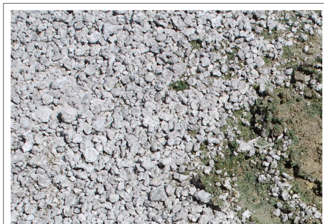
FIGURE 1 | Zoom in highlighting pigmented phototrophic microbial community exposed following disturbance of a thin loose siliceous sinter cover layer due to a footprint, Norris Geyser Basin, Yellowstone National Park, WY, USA. Image is ~15 cm across. Research was conducted under Yellowstone Research Permit YELL-2016-SCI-7020.

Mounting geochemical evidence in rocks of Archean age suggests free oxygen driving oxidative weathering as far back as 3.0 Ga (e.g., Anbar et al., 2007; Kump and Barley, 2007; Wille et al., 2007; Frei et al., 2009; Holland, 2009; Reinhard et al., 2009;