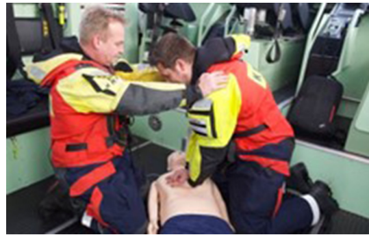
FIGURE 1 Lifeboat-crewmember demonstrating CPR with support by another crewmember (photograph by K. Knol-Boscher).

This was a prospective two arm parallel mannequin study. The local ethics committee of the University Medical Center Groningen