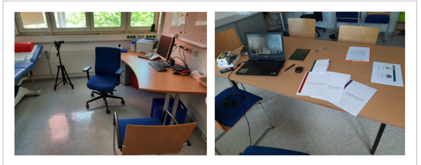
FIGURE 2 Room where the PA consultation session took place (left); room where interviews and observations were conducted (right).

The usage phase was dedicated to app usage in daily life over a time-span of 14 days by persons with CVD. During this time, the person was asked to use the aktivplan app to perform, track and document their exercise training as planned with the healthcare professional in the PA consultation session. Frequency and types of training activities had been individually determined, depending on the person's fitness level and state of health (as judged by the healthcare professional). In addition to using the app, the person with CVD was asked to complete a pen and paper diary (Figure 3) with questions about their physical activities, and impressions and usage experiences with the app (Section 2.1.3).