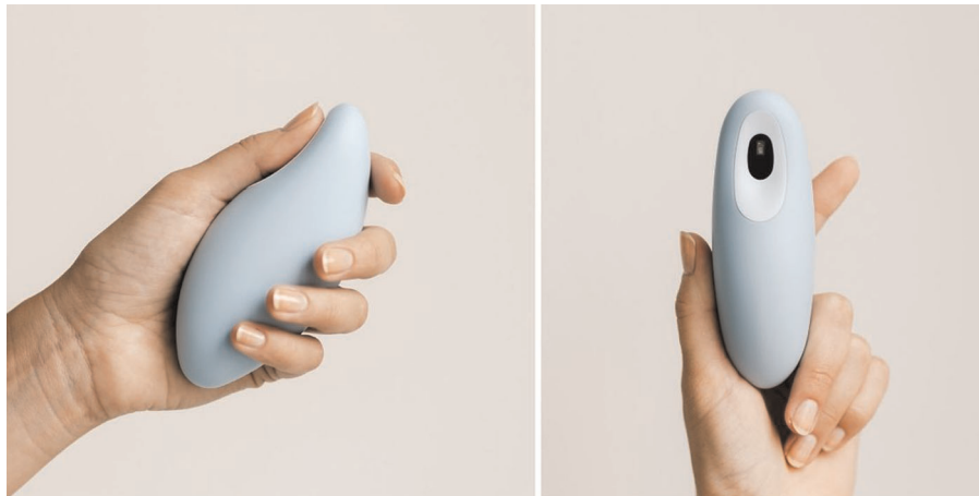
FIGURE 1 The Moonbird breath pacer, including a PPG sensor (right picture).