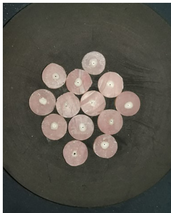
FIGURE 3 Dentin discs after force is applied.

The Shapiro-Wilk test indicated that the data were normally distributed. The Kruskal-Wallis test was used for intergroup comparisons within the scope of the study, and the Mann-Whitney U test was used as a post hoc test. The data were analyzed using the SPSS 22.0 (IBM-SPSS Inc., Chicago, IL, USA)