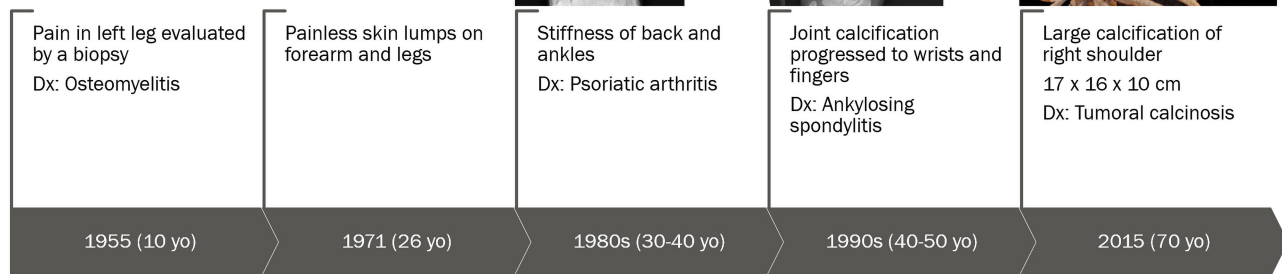
FIGURE 1 | Graphical representation of clinical course. At age 10 years, patient experienced unusual pain in her left leg that represented hyperostosis-hyperphosphatemia syndrome, which was evaluated with a biopsy and misdiagnosed as osteomyelitis. At age 26 years, she started noticing painless skin lumps on her forearm and legs. In her 30s, she started experiencing back pain and joint stiffness in her ankles and fingers. She was then evaluated by a rheumatologist and was diagnosed with an ill-defined rheumatologic disorder, possibly psoriatic arthritis. Over the next 30 years, the arthritis slowly progressed to involve almost all joints of her body. Eventually this was determined to be an aggressive form of osteoarthritis, currently felt not to be related to underlying HFTC. In 2015, a large bump appeared around her right shoulder, which was initially thought to be a sarcoma. Upon biopsy, bone calcifications were found with the possibility of tumoral calcinosis.

The unique dental phenotype of HFTC has been recently described in detail by our group (4). Internal pulp calcification and thistle-shaped, short roots with midroot bulging were most commonly observed in almost all of our cohort of 17 patients. The pulp can be partially to completely obliterated. Maxillary and mandibular premolars are most severely affected. In addition, primary dentition from pediatric patients with HFTC had findings similar to the permanent teeth.