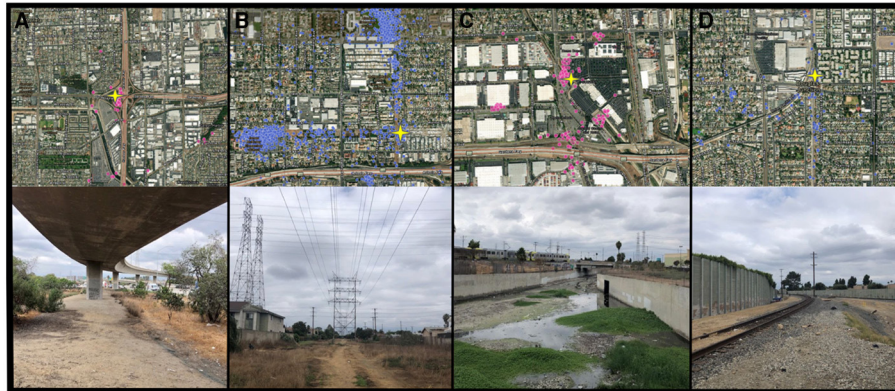
FIGURE 2 | The infrastructural signature in Los Angeles, California, as shown in coyote space use. The figure illustrates GPS location data showing how individual coyotes selectively use human infrastructural forms in South Los Angeles: (A) freeway interchange, (B) power line corridor, (C) flood control channel, and (D) railway lines. Image boxes on the top row show aerial maps with coyote GPS collar locations; photos on the bottom row offer an on-the-ground perspective from locations indicated by a yellow star on the corresponding aerial map. Base map powered using ArcGIS with software from Esri, with data points provided by Dr. Niamh Quinn, UCANR.

(Johnson and Munshi-South, 2017; Schell et al., 2020b). Like all environments, cities have socio-ecological trajectories; city age, cultural history and former land uses all influence the ecological response to the urban environment (Ramalho and Hobbs, 2012; Schell et al., 2020a). Within the span of days, animal movement and habitat selection are influenced by fluxes in human presence and daily rhythms (Nickel et al., 2020). For instance, temporal patterns created by commuting and those relating to human leisure often result in animals adjusting their movement patterns to accommodate the intricate human processes of daily life (Nix et al., 2018). City streets or city parks might be unavailable during the day because of foot and auto traffic, but become prime habitat in the dead of night.