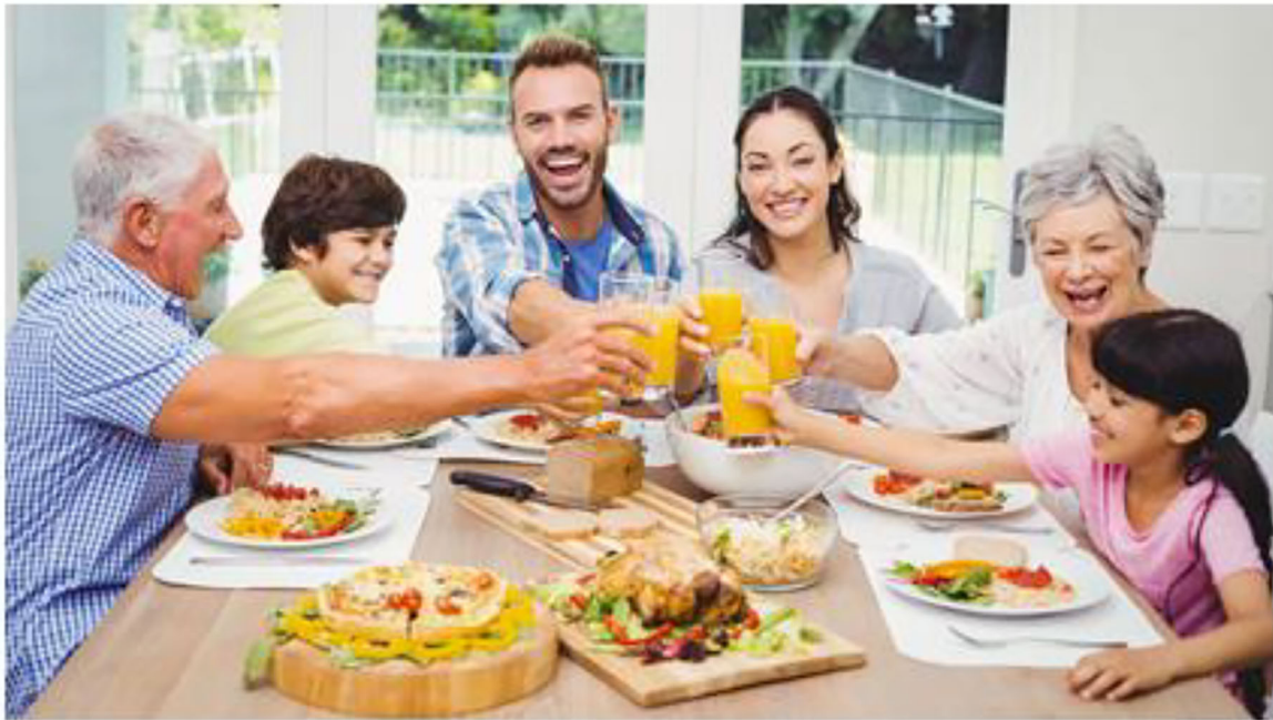
FIGURE 2 | Depiction of “sensory interaction screen”.

management and data collection system around it. We used the development process theory described at length previously (Tziraki et al., 2017), aiming to create a theory-based SG4D, with input from a multi-disciplinary team familiar with aging, dementia, user experience design, gaming theory, and technology, as well as direct input from end users (using the iterative process, see Valdez et al., 2015) and data collected automatically by the system.