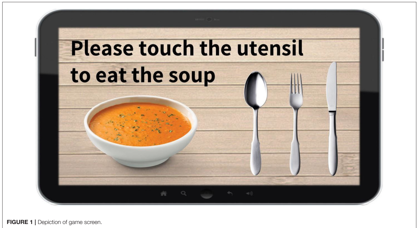
FIGURE 1 | Depiction of game screen.