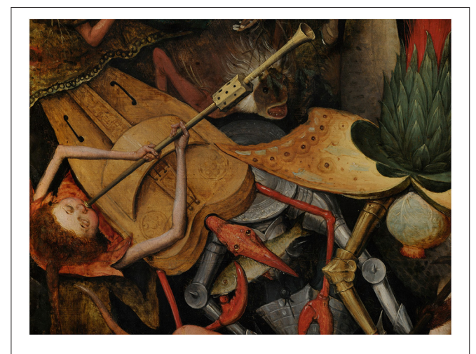
FIGURE 11 | Pieter Bruegel the Elder, The Fall of the Rebel Angels, 1562, detail

and angular elbows as the lobster crawling above him or her. Crossing over the lobster's left limb, the arm of an artichoke-like piece of vegetable is covered in a suit of armor exactly similar to that of the archangel Michael. Meanwhile, under the artichoke's arm, yet another armed limb is part of a full suit of armor, covering a body that lost its kinematic coherence, engulfed as it is in the mass of bodies. The similarity between these different