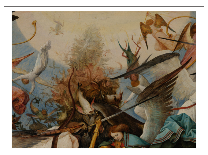
FIGURE 9 | Pieter Bruegel the Elder, The Fall of the Rebel Angels, 1562, detail.

of their successive discoveries. Within the general momentum of the flow, the painting contains multiple scenes that have their own implied timing and tempo. For instance, tempo is suggested by the gestures of the archangel Michael and his warring companions, who repeatedly slash with their swords at the magma of creatures surrounding them. The tempo of striking and the timing of each wounding impact add to the momentum of Michael's surfing in the flow of creatures, his feet planted on the back of the beast of the Apocalypse hurled headlong. The beast's enormous body is gradually discovered behind multiple