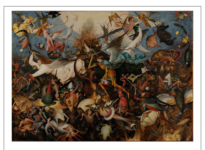
FIGURE 8 | Pieter Bruegel the Elder (1527/30-1569), The Fall of the Rebel Angels , 1562, huile sur chêne (117 × 162 cm), Bruxelles, Musées royaux des beaux-arts de Belgique. Public domain, sous license CC BY-SA 2.0. https://fr.wikipedia.org/wiki/Fichier:Pieter_Bruegel_the_Elder_-_The_Fall_of_the_Rebel_Angels_-_Google_Art_Project.jpg.

of their successive discoveries. Within the general momentum of the flow, the painting contains multiple scenes that have their own implied timing and tempo. For instance, tempo is suggested by the gestures of the archangel Michael and his warring companions, who repeatedly slash with their swords at the magma of creatures surrounding them. The tempo of striking and the timing of each wounding impact add to the momentum of Michael's surfing in the flow of creatures, his feet planted on the back of the beast of the Apocalypse hurled headlong. The beast's enormous body is gradually discovered behind multiple