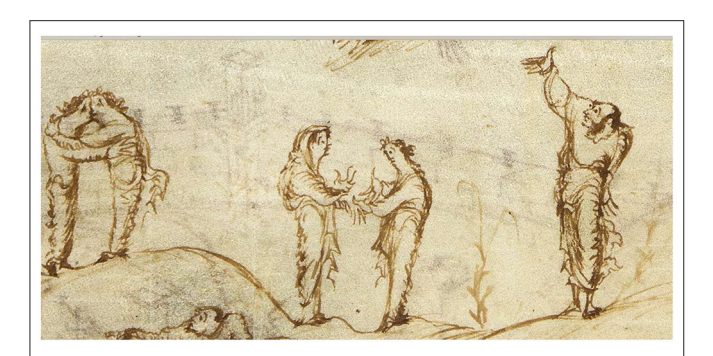
FIGURE 1 | The Utrecht Psalter (Utrecht, Universiteitsbibliotheek, MS 32), fol. 49v, Psalm 84, detail, https://psalter.library.uu.nl/page/106.

and it may be activated either when the person iteratively induces targeted sensations<sup>5</sup>, or when they see a movement that triggers in them the cognitive inferencing of such sensations.