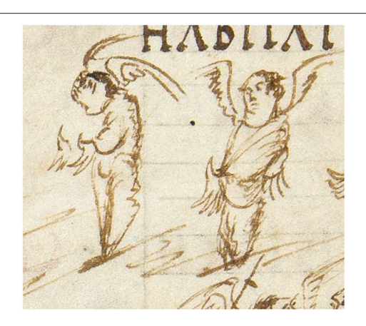
FIGURE 2 | The Utrecht Psalter (Utrecht, Universiteitsbibliotheek, MS 32), fol. 51r, Psalm 87, detail, https://psalter.library.uu.nl/page/109.

Benesh notation)<sup>9</sup>. Yet, even when a coding system is available, the exact manner of a gesture remains challenging to convey. In this respect, literature is a valuable source of information, as authors through centuries have found ways of using language to express complex sensorial and perceptual information.