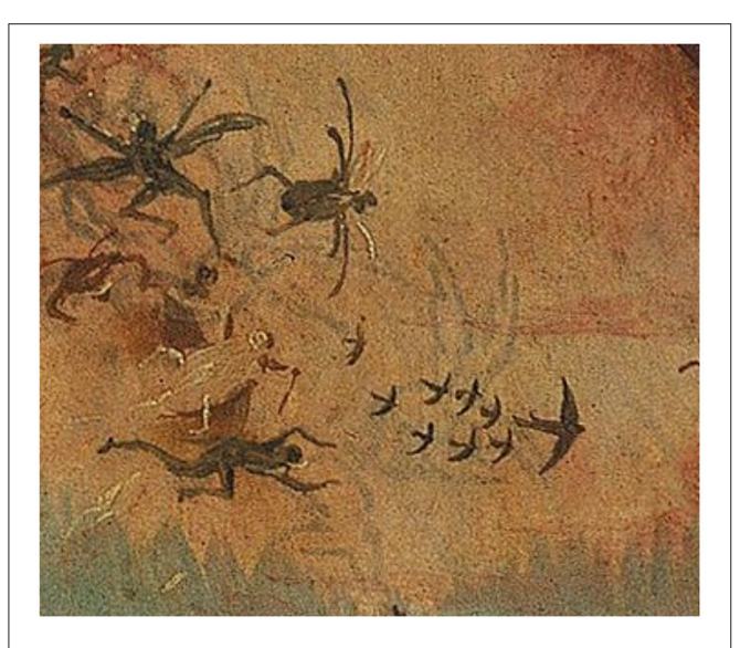
FIGURE 7 | Hieronymus Bosch, The Haywain Triptych, 1512–1515, inner left wing, 147 x 66 cm, oil and tempera on oak panel, Madrid, Museo del Prado, detail.