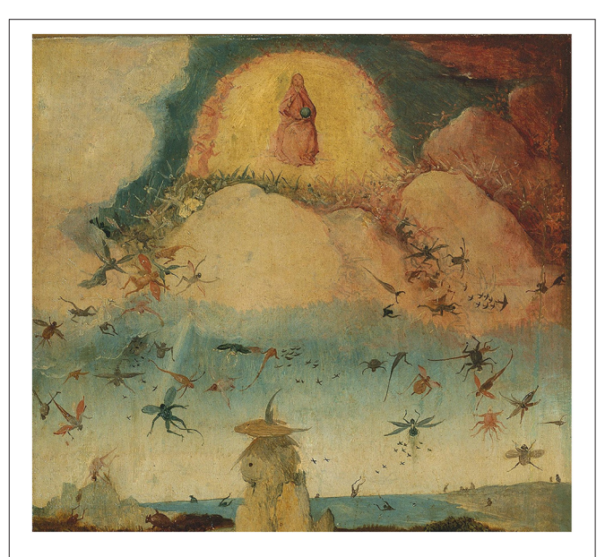
FIGURE 6 | Hieronymus Bosch, The Haywain Triptych, 1512–1515, inner left wing, 147 x 66 cm, oil and tempera on oak panel, Madrid, Museo del Prado, detail. https://www.museodelprado.es/en/the-collection/art-work/the-haywain-triptych/7673843a-d2b6-497a-ac80-16242b36c3ce?searchMeta=rebel%20angels. https://commons.wikimedia.org/wiki/File:Bosch_-_Haywain_Triptych.jpg.

and the expulsion from Eden), which unfold on two thirds of the painting, while the upper third of the panel represents the sky, where God in Majesty, surrounded by a mandorla of bright light, sits in the far distance.