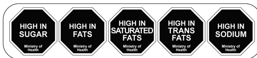
FIGURE 1 | PAHO. (n.d.). Front-of-package labeling—PAHO/WHO|Pan American Health Organization. Retrieved October 16, 2021, from https://www.paho.org/en/topics/front-package-labeling .

trade law (Boza et al., 2019; Thow et al., 2019). FOPL was effectively transferred from the authority of public health experts in a “public” venue, into a venue intended for the promulgation of industry interests and trade—a “hybrid” venue (Clapp, 1998)—where the private sector has significant influence. Here, industry actors have detailed knowledge about process rules and operating culture (Murphy, 2015), leading to the successful frame-shift of FOPL from a health solution to a trade problem. FOPL—intended to curb sales of ultra-processed foods—is in direct conflict with the food industry’s profit from the sales of these food products—leading to a significant interest conflict, but one where industry actors have the upper hand.