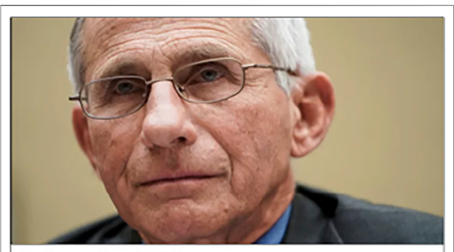
Anthony Fauci, M.D. Director of National Institute of Infectious Diseases March 29 at 1:23 PM

Study 2 included a representative U.S. sample recruited through Amazon Mechanical Turk and paid for their participation. A power analysis with a significance level of 0.05 at 0.80 power indicated the required sample of 43 participants per condition (516 total). A total of 543 U.S. respondents (58.5% male) aged 18-79 years old (M=40.9, SD=17.2) completed the study. They