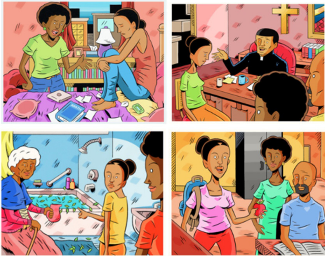
FIGURE 2 | Haitian Kreyol radionovela and graphic story.

provided opportunities for the community co-creators to speak of their experiences and beliefs in a safe and welcoming setting. The result was a graphic story in comic book style that was also very well-received (Villar and Bauduy, 2014). These experiences demonstrate the need to engage community members in co-creation to ensure that the best method(s) of communication are used for maximum effectiveness (see Figures 1, 2 ).