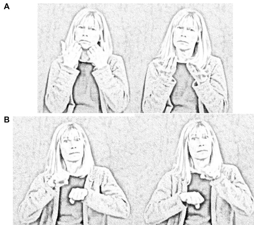
FIGURE 1 | Examples of two-handed balanced signs from ASL classified as symmetrical (A) or alternating (B) . (A) SHAME, is produced with a single movement of both hands moving away from the signer's body; (B) BICYCLE, is produced with two hands moving in a repeated alternating cyclic motion (We follow the field's convention of glossing signs with small caps). Examples are from the online dictionary ASL-Lex (Caselli et al. 2017).