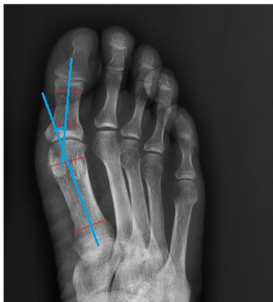
FIGURE 2 The measurement of hallux valgus angle.

than those in the HV group ( P < 0.05 ). There were no significant differences in gender, residence, duration of diabetes, duration of diabetic foot disease, and drinking history between the two groups ( P > 0.05 ). In terms of diabetic complications and chronic complications, the proportion of autonomic neuropathy in the non-HV group (64.9%) was significantly higher than that in the HV group (38.8%). The incidence of coronary heart disease in the HV group was significantly higher than the non-HV group. Although there were no significant differences in the prevalence of retinopathy, neuropathy, diabetic nephropathy, hyperlipidemia and cerebrovascular disease between the two groups, the creatinine value of the HV group was significantly higher than that of the non-HV group ( P < 0.05 ), and the estimated glomerular filtration rate (eGFR) was significantly lower than that of the non-HV group ( P < 0.05 ). There were no significant differences in the history of foot ulcers, amputations, hospitalized amputation/toe rates, and the incidence of gangrene, necrotizing fasciitis, compartment syndrome, and Charcot foot between the two groups, nor the PEDIS classification (Table 1) and Wagner classification (data not shown).