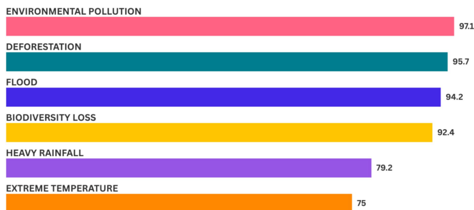
FIGURE 1 Experience of environmental issues in Bangladesh.