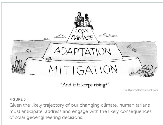
FIGURE 5 Given the likely trajectory of our changing climate, humanitarians must anticipate, address and engage with the likely consequences of solar geoengineering decisions.

The current state of affairs yields a world in which mitigation is not happening fast enough, adaptation does not go far enough, and Loss and Damage mechanisms are nascent at best (see Figure 5). This is a recipe for human suffering. At the same time, the pace of conversation on solar geoengineering has accelerated. Should humanitarians embrace solar geoengineering offerings as an imperfect, but possibly a better option than the consequences of not mitigating and adapting fast enough?