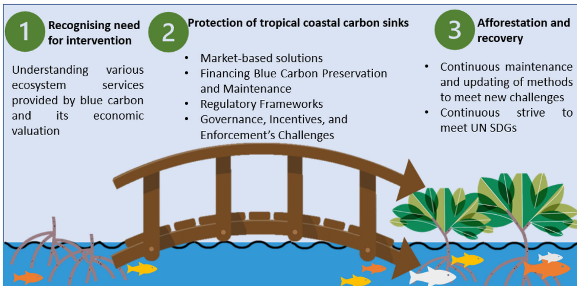
FIGURE 1 Roadmap for the protection of tropical blue carbon ecosystems.