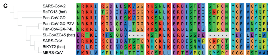
FIGURE 1 | Putative integrin-binding motifs on the SARS-CoV-2 receptor-binding domain. The SARS-CoV-2 receptor-binding domain (RBD) amino acid sequence is shown with the putative integrin-binding motifs marked in red (A). The SARS-CoV-2 spike RBD is depicted with the predicted structurally-accessible integrin-binding motifs highlighted in different colors (B). The spike RBD is shown aligned with the PDB: 6m0j structure in order to show the potential accessibility of these motifs when the spike protein is bound to the canonical host cell entry receptor ACE2 (green) (B). A sequence alignment of the putative integrin-binding motifs found on the SARS-CoV-2 receptor binding domain with spike sequences from the SARS-CoV, RaTG13, MERS-CoV, Pan-CoV-GD, Pan-CoV-GX-P4L, Pan-CoV-GX-P2V, SL-CoVZC45, BtKY72 betacoronavirus strains is shown with a corresponding phylogenetic tree of the coronavirus genomes generated using FastTree 2.1 and visualized with iTOL (C).

motif. Interestingly, some spike motifs were highly similar to integrin-binding motifs but the amino acids were out of order. For example, the spike ERDI motif was found to be 50% similar to the \alpha_v\beta_6 -binding REDV motif by alignment of the D and I/V residues, but the E and R residues were found on both motifs in a different order. This was also the case for the similarity between the ATN-161 pentapeptide sequence (PHSCN) and the spike STPCN motif, in which both the P and S residues are present but in a different order. Furthermore, the similarity to the ATN-161 pentapeptide is interesting considering studies that suggest its protective ability against SARS-CoV-2 infection, although the peptide has been suggested to also bind the RGD-binding site on integrins (Amruta et al., 2021; Beddingfield et al., 2021). Structural analysis to investigate the accessibility of the motifs on the spike protein may lend more insights into their potential ability to bind integrins.