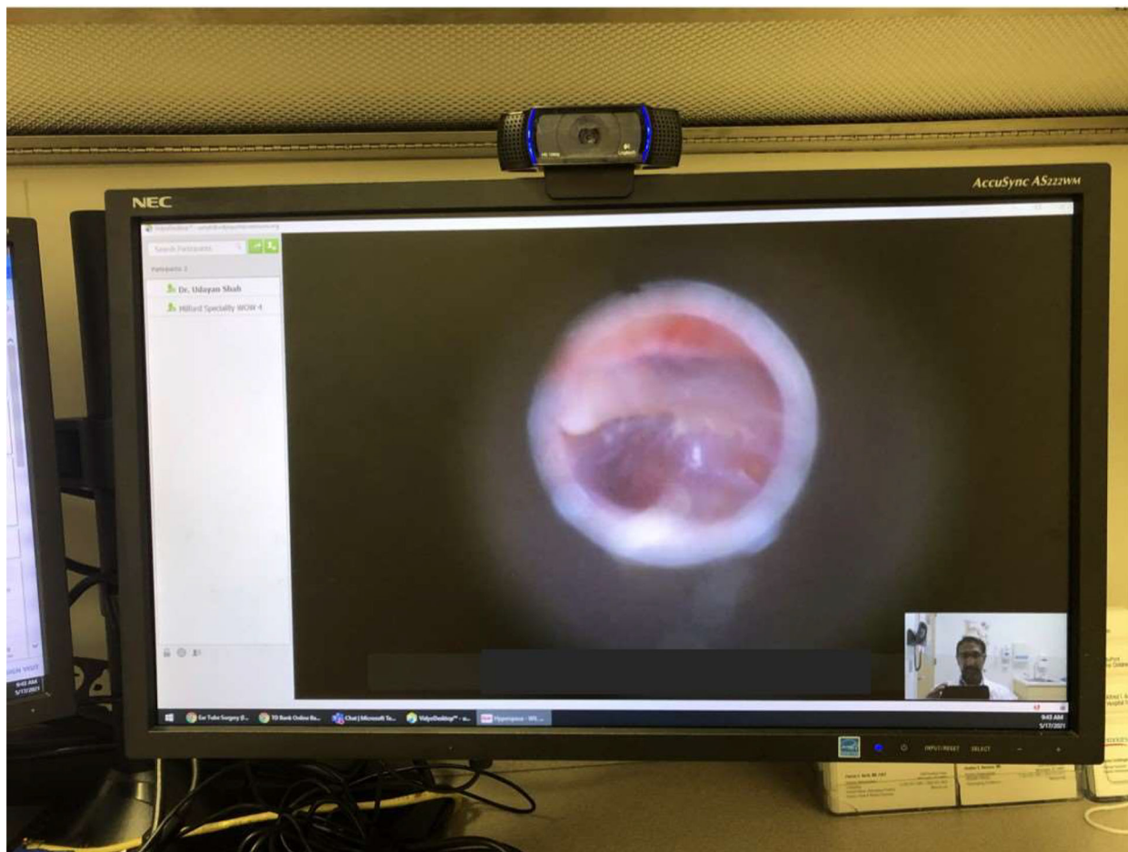
FIGURE 3 | Otoscopy via telemedicine. The camera is at top of the monitor.

Because AOM is the most common reason for pediatric outpatient visits, HBT can offer earlier, more accurate diagnoses for primary care providers, meaning more judicious