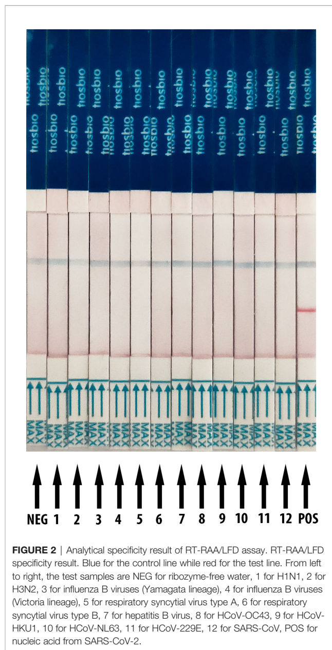
FIGURE 2 | Analytical specificity result of RT-RAA/LFD assay. RT-RAA/LFD specificity result. Blue for the control line while red for the test line. From left to right, the test samples are NEG for ribozyme-free water, 1 for H1N1, 2 for H3N2, 3 for influenza B viruses (Yamagata lineage), 4 for influenza B viruses (Victoria lineage), 5 for respiratory syncytial virus type A, 6 for respiratory syncytial virus type B, 7 for hepatitis B virus, 8 for HCoV-OC43, 9 for HCoV-HKU1, 10 for HCoV-NL63, 11 for HCoV-229E, 12 for SARS-CoV, POS for nucleic acid from SARS-CoV-2.

To evaluate the clinical performance of the SARS-CoV-2 RT-RAA/LFD assay, RNAs obtained from clinical samples were detected with RT-RAA/LFD and RT-qPCR, respectively. As shown in Table 2 , the RT-qPCR results illustrated 13 samples were positive for SARS-CoV-2, with CT values ranging from 21.16 to 37.51 ( 10^5 to 10^1 copies/ \mu l). The results of RT-RAA/LFD