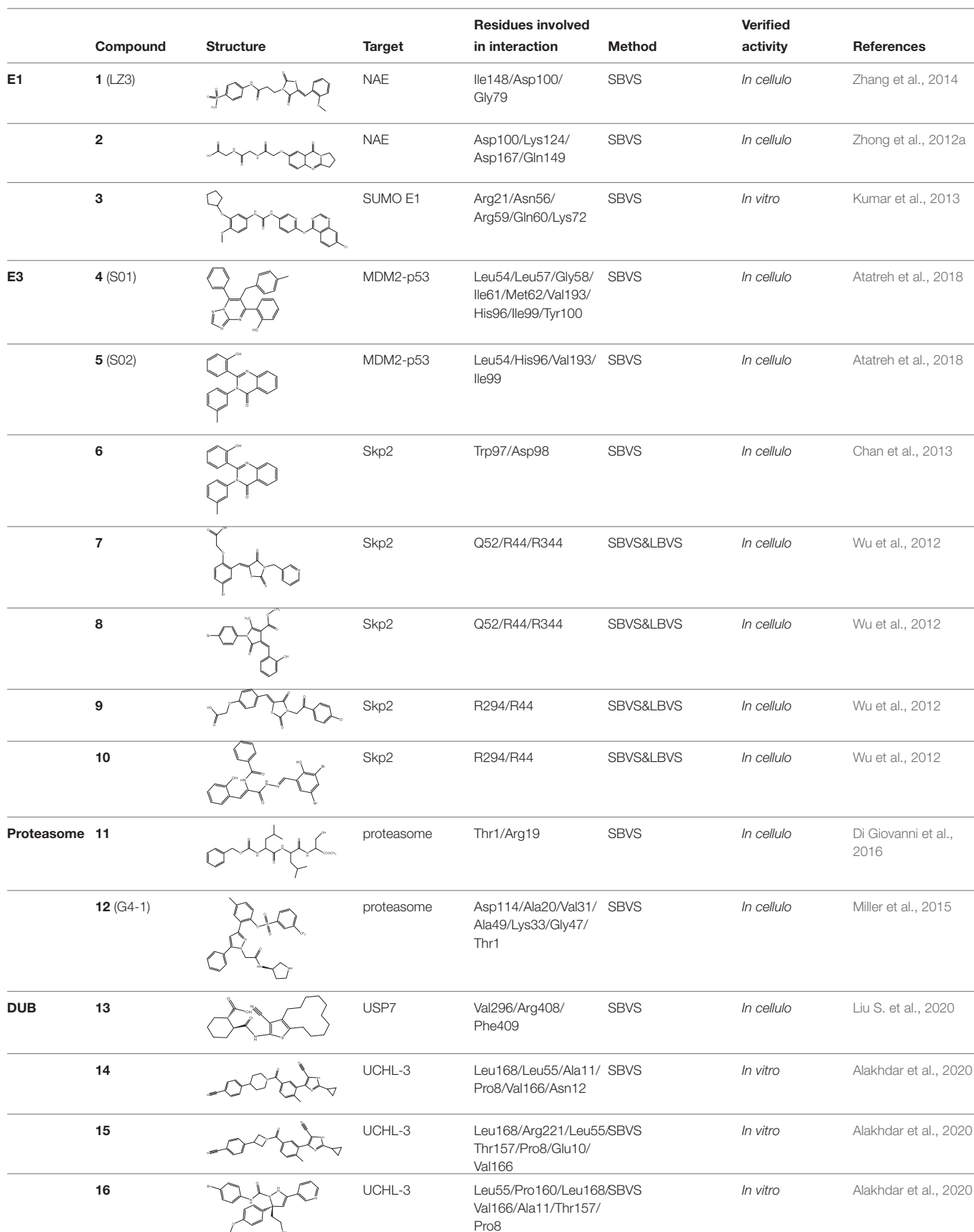
TABLE 1 | Ubiquitination regulators identified by virtual screening.