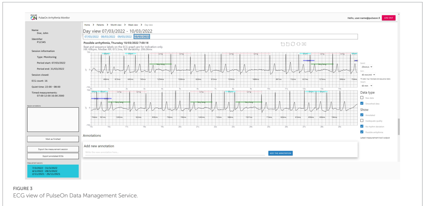
FIGURE 3 ECG view of PulseOn Data Management Service.

PPG and the ECG analysis algorithms. Another cardiologist (KK) assessed the cardiac rhythm from the wrist device ECG recordings blind to the reference data. HJS also assessed the rhythm using the wrist device ECG recordings. This assessment was done after a significant amount of time (approximately 6 months) had elapsed since annotating the Holter-recordings to retain objectivity regarding the assessment. The cardiologists' wrist device ECG appraisals were used for data quality assessment and to determine how many subjects showing AF in the Holter-recordings could be correctly classified visually using only the wrist device data.