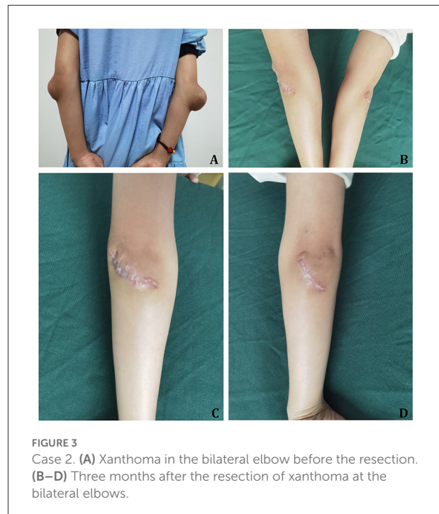
FIGURE 3 Case 2. (A) Xanthoma in the bilateral elbow before the resection. (B–D) Three months after the resection of xanthoma at the bilateral elbows.

Molecular hereditary tests were conducted in March 2020 (Guangzhou KingMed Diagnostics Center). The result was a splice mutation at intron 7 and intron 9 on chromosome 2p21 of the ABCG5