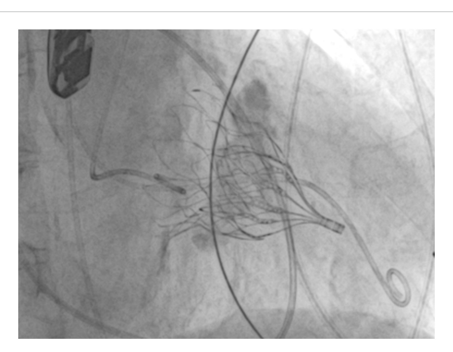
FIGURE 4 Fluoroscopy image showing a successful Tendyne implantation in severe mitral annular calcification (MAC).

The presence of MAC in patients with significant mitral valve disease represents a challenging anatomical scenario, both from a surgical and a transcatheter point of view.