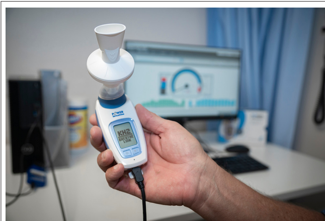
FIGURE 1 | Handheld POWERbreathe training device.

and older (MA/O) adults with OSA. However, the results for OSA adults are preliminary and require confirmation in a larger group of patients. Furthermore, guidelines issued by the American College of Cardiology and the American Heart Association (ACC/AHA) indicate that non-pharmacological therapies designed to reduce BP should be assessed for efficacy within 3–6 months of treatment initiation (28), and the efficacy of high-resistance IMST administered over the longer-term has yet to be assessed. By extension, it is not known how long IMST-induced BP reductions persist after training cessation. Lastly, in view of evidence that high-resistance IMST improves endothelial function in otherwise healthy MA/O adults with above-normal BP (52), the potential for IMST to induce similar benefits in MA/O adults with OSA warrants assessment.