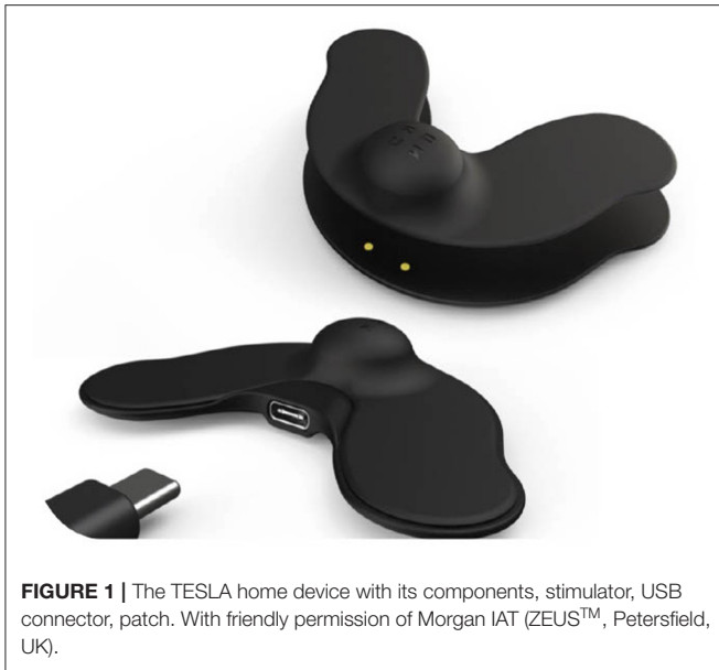
FIGURE 1 | The TESLA home device with its components, stimulator, USB connector, patch. With friendly permission of Morgan IAT (ZEUS™, Petersfield, UK).

the procedure is conducted by clinicians specialised in OSA management (28).