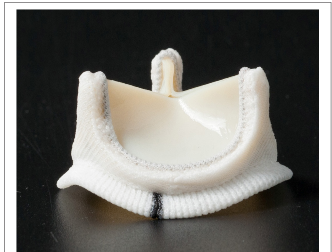
FIGURE 1 | The Cingular bovine pericardial valve.

Aortic or mitral valve replacement was performed at the discretion of the investigator using either routine median sternotomy or upper hemisternotomy. Ascending aortic and venous cannulation was performed, standard cardiopulmonary bypass commenced, and mild hypothermia applied, followed by an induction of cardiac arrest by antegrade or combined with retrograde infusion of del Nido or Buckberg blood cardioplegia.