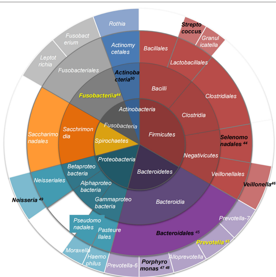
FIGURE 1 | The dominant tongue coating microbiota at each taxonomic level. Different phyla are color-coded; layers from the inside to outside are phylum-class-order-genus. Black text indicates microbiota whose abundance is increased in metabolic diseases, and yellow text shows microbiota whose abundance is decreased in metabolic diseases (44–50).

in healthy controls (13). RA patients present with an increased relative abundance of pro-inflammatory species.