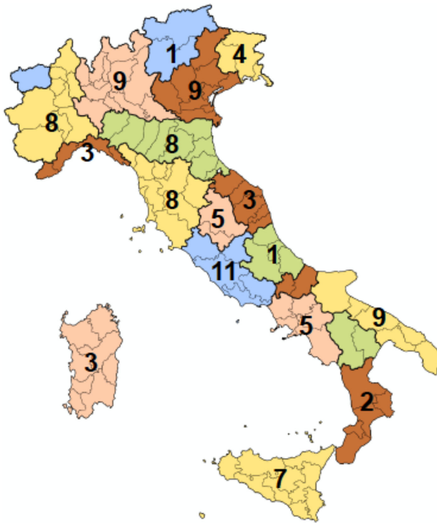
FIGURE 1 | Geographical distribution by region of centers included in the survey ( n = 96 ).

As expected, all cancer centers took care of a wide range of cancer patients, including rare ones, but also general hospitals with a cardio-oncology service dealt with more than three cancer types in 77% of cases. Overall, the more frequent cancer type requiring a CO consultation was breast cancer, followed by lung cancer and gastro-intestinal cancer. The differences in CO teams between cancer centers and general hospitals were remarkable. While in five out of nine (56%) cancer centers an official team or a pool of dedicated cardio-oncologists was available, this percentage dropped to 20% (18 out of 87) in general hospitals, leading to an overall percentage of 24% (Figure 2, top panel).