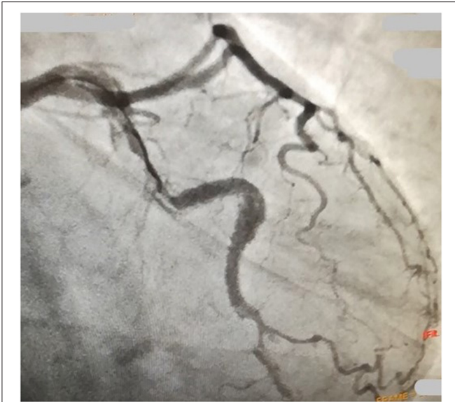
FIGURE 2 | A cardiac catheterization image evidences the progression of the dissection until the circumflex artery after percutaneous coronary intervention (PCI).

4,5g iv three times daily and caspofungin 50 mg iv once daily) and prophylactic anticoagulant (enoxaparin sodium 4000 UI twice daily for the first 2 weeks and then 4000 UI one daily).