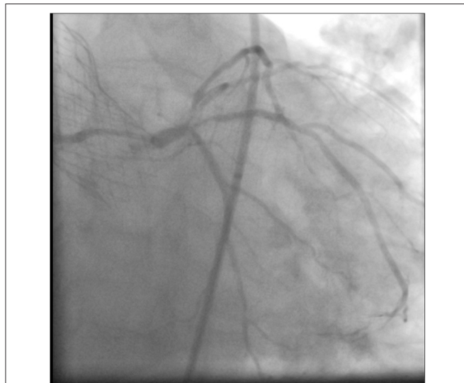
FIGURE 1 | Coronary angiography showing a tapering distal LMS lesion, with critical proximal LAD disease. There is also a severe ostial D1 lesion, severe proximal intermediate disease, and diffuse diabetic disease throughout.

There is a paucity of data describing the incidence of coronary events following TAVR, although given the progressive nature of CAD, CA, and PCI will become increasingly necessary in patients after TAVR (9). Therefore, acquisition of appropriate images of the coronary arteries by selective CA is paramount to establish an accurate diagnosis and management strategy. However, the presence of a TAVR bioprosthesis could potentially complicate or inhibit the selective catheterization of the coronary ostia. Existing data, based on isolated cases and small series globally, have assessed the safety and feasibility of CA and PCI following TAVR. Chetcuti et al. (10) reported successful coronary access in 186/190 (97.9%) of their cases but successful PCI in only 103/113 cases (91.2%) following CoreValve TAVR.