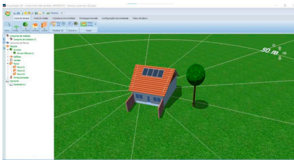
FIGURE 3 3D modeling of Model 1.

roof slope, type, and total surface area. Furthermore, it enables the consideration of potential peripheral obstructions that might cast shadows, consequently affecting power generation efficiency. The software also permits the definition of the building's characteristics, encompassing measurements, height of the eaves, number of floors, and various visual elements that, although not directly impacting dimensioning, contribute to a comprehensive representation of the building. This can include features such as windows, doors, and side walls, contributing to the model's overall accuracy.