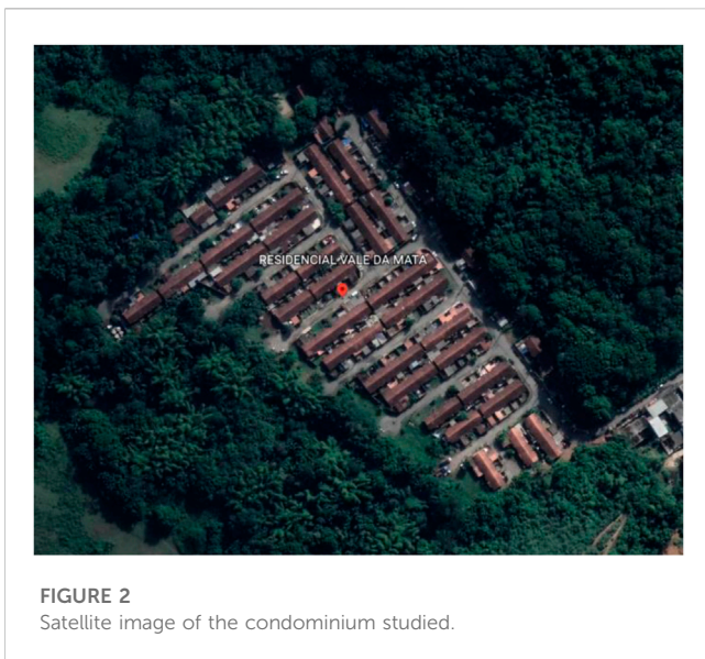
FIGURE 2 Satellite image of the condominium studied.

The sum of the thermal losses of the primary and secondary circuits ( E_{losses} ) will be calculated by the sum of the losses of energy presented in Eq. 5.