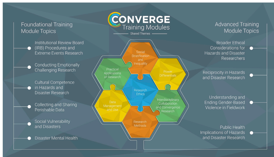
FIGURE 1 CONVERGE Training Module series cross-cutting themes.

(Bullard, 2008; Tierney, 2019; Yellow Horse et al., 2020). Accordingly, each of the CONVERGE Training Modules centers considerations of social stratification and inequality. For example, the Social Vulnerability and Disasters module examines the socioeconomic and political root causes of disaster vulnerability, summarizing decades of research showing that marginalized social groups are more exposed to hazard risk and therefore susceptible to disaster harm and unequal losses. Older adults are one example of a socially vulnerable population; their risk may be due to intersecting factors such as living in isolation, having limited financial resources, or experiencing chronic health issues and disabilities that interfere with daily functioning. Together, these factors influence their ability to anticipate, cope with, resist, and recover from disasters.