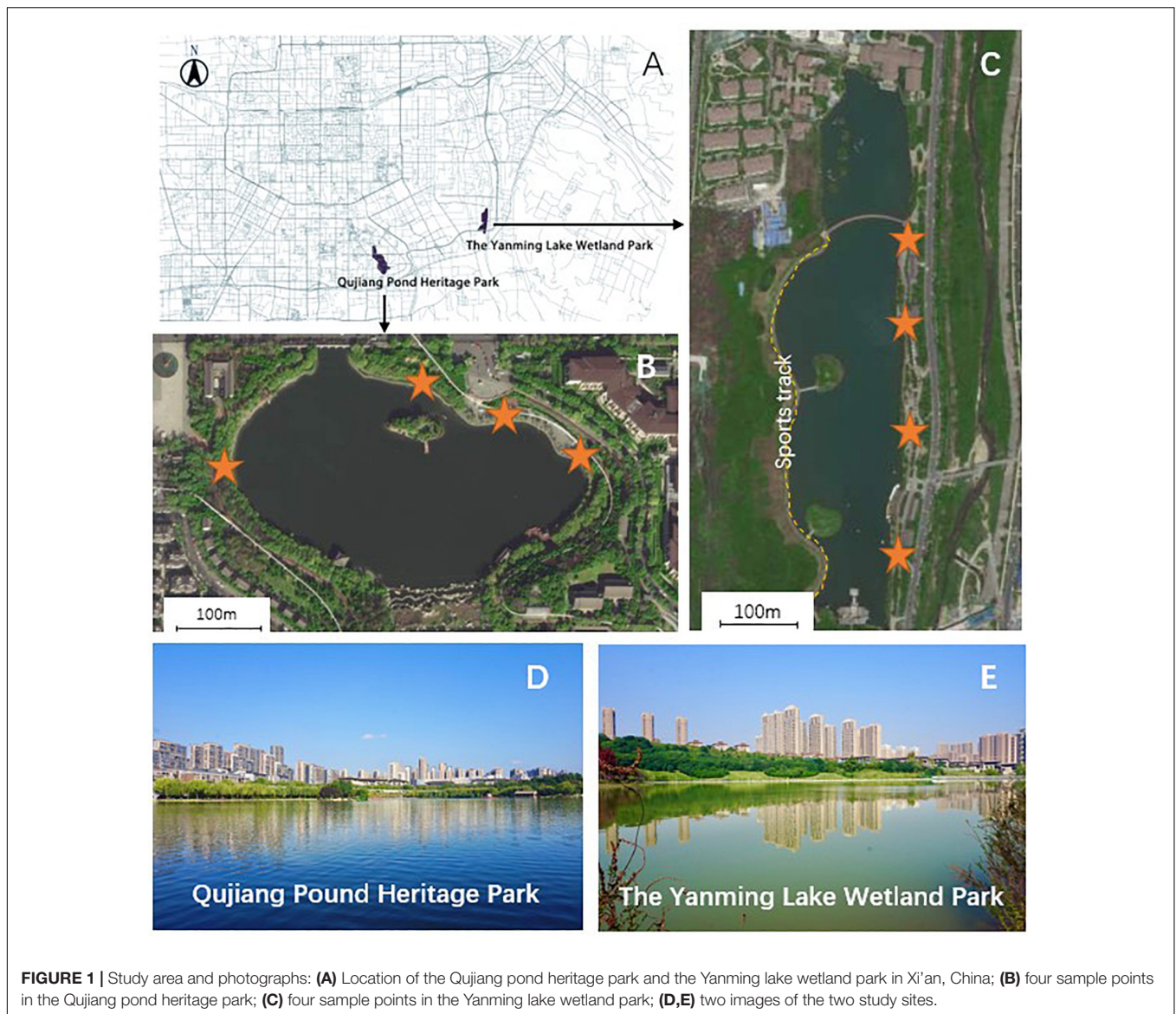
FIGURE 1 | Study area and photographs: (A) Location of the Qujiang pond heritage park and the Yanming lake wetland park in Xi'an, China; (B) four sample points in the Qujiang pond heritage park; (C) four sample points in the Yanming lake wetland park; (D,E) two images of the two study sites.

the questionnaire survey was conducted, including temperature ( 15.45^{\circ}\text{C} , SD = 2.58^{\circ}\text{C} ), relative humidity ( 63.35\% , SD = 11.47\% ), and wind speed ( 0.75\text{ m/s} , SD = 0.66\text{ m/s} ). In addition, types of sound sources and sound levels can affect the subjective attitude to soundscape (Völker et al., 2018). In the pre-experiment before the field survey, the sound sources in the two sample parks were similar according to the perceptions of the respondents, which indicated that the two parks have a similar soundscape. As to each site's sound levels, it was measured continuously for 8 h, from approximately 9:00 a.m. to 5:00 p.m. via Kjaer 2250 class 1 sound level meter (SLM; 1-s logging period). Stable sound conditions were guaranteed at a similar level in each site each day with an average sound level of 64.10 dBA.