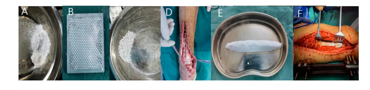
FIGURE 1 Preparation and implantation effect of calcium sulfate in surgery.

water for injection into a sterile mixing bowl and thoroughly stir until a uniform paste is formed; the calcium sulfate was shaped according to the geometric shape of the bone defect at the bone graft site, and the preparation was completed after curing for 30 min–60 min. The specific preparation and implantation effect are shown in Figure 1.