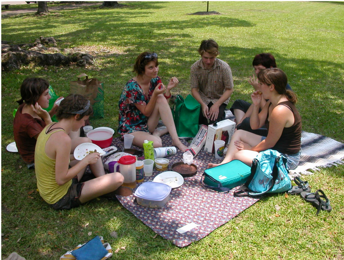
FIGURE 3 | Picnic. From Wikimedia Commons, with a Creative Commons License https://commons.wikimedia.org/wiki/File:Our_pre-July_4th_picnic_NOLA.jpg .

QA datasets prior to SQuAD 2.0 had contained a fraction of questions that were unanswerable, due mostly to noise. These were mostly easy to detect as they did not have plausible answers. Jia and Liang (2017) had proposed a rule-based method for generating unanswerable questions; these were less diverse and less effective than the crowd-sourced questions created for SQuAD 2.0.