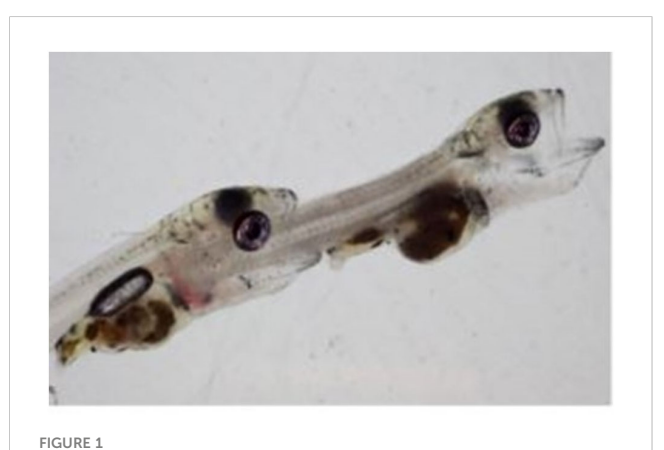
Example of type II cannibalism where the victim is completely consumed.

documented in early larviculture of closely related pikeperch ( Sander lucioperca ) in intensive systems (Steenfeldt, 2015).