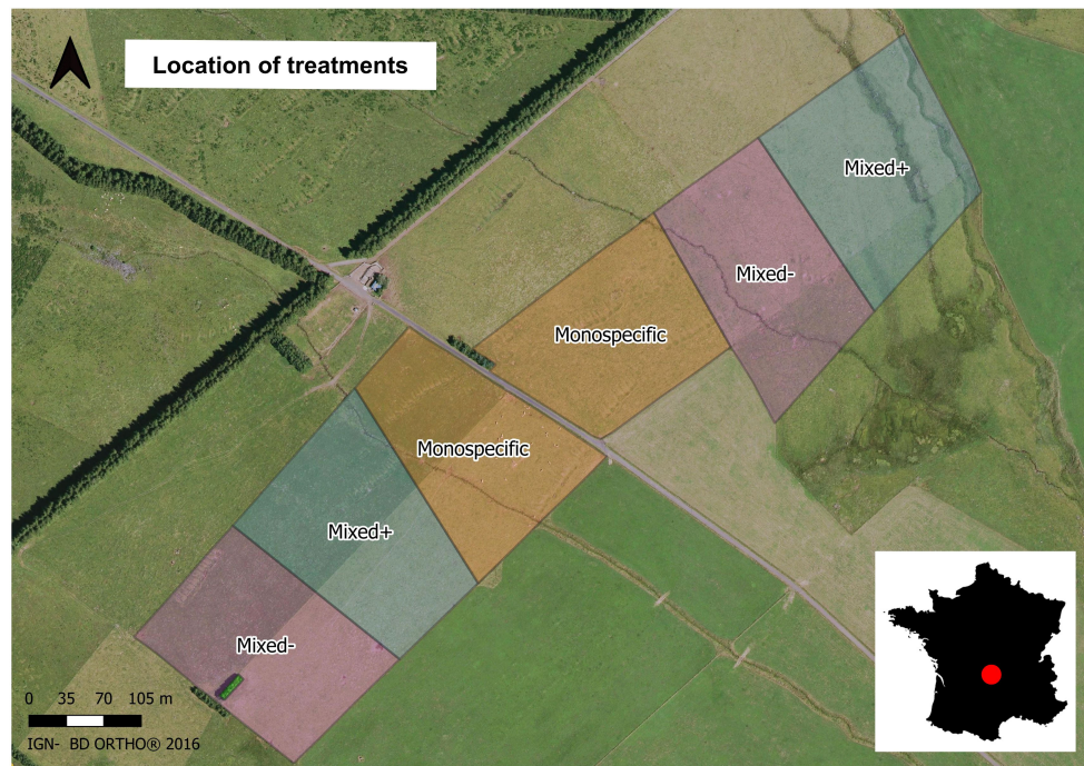
FIGURE 1 Paddocks and treatments (experiment carried out in 2019 and 2020). Monospecific: sheep grazing only, Mixed-: sheep/cattle grazing with balanced groups, and Mixed+: sheep/cattle grazing with groups skewed toward cattle (detailed compositions in Table 1 ).

We chose the number of animals to comply with our research questions and protocol, and to balance the stocking rates among treatments ( Table 1 ). We used 5- to 9-month-old ewe lambs even though younger animals may have produced clearer results regarding parasitism, as young animals have less efficient immune systems than older animals ( Schallig, 2000 ). We used these animals as a compromise, as their immune system is not fully developed and they were not too shy to allow observations of foraging behavior. As explained below, we used this type of method and during these observations, the animals must be approached to allow the observer to visually determine which component of the sward is consumed, which cannot be done with animals that are easily scared. The ewe lambs in our experiment were also mixed with some adult ewes to ‘train’ them to graze, as the adult-offspring relationship is known to improve dietary choices ( Orr et al., 1995 ; Glasser et al., 2009 ). Regarding cattle, the choice of animal type was driven by convenience, since our experiment focused on sheep. We used Holstein heifers as they did not need milking and represented a low LU per individual, which made it easier to balance the stocking rates among treatments ( Table 1 ).