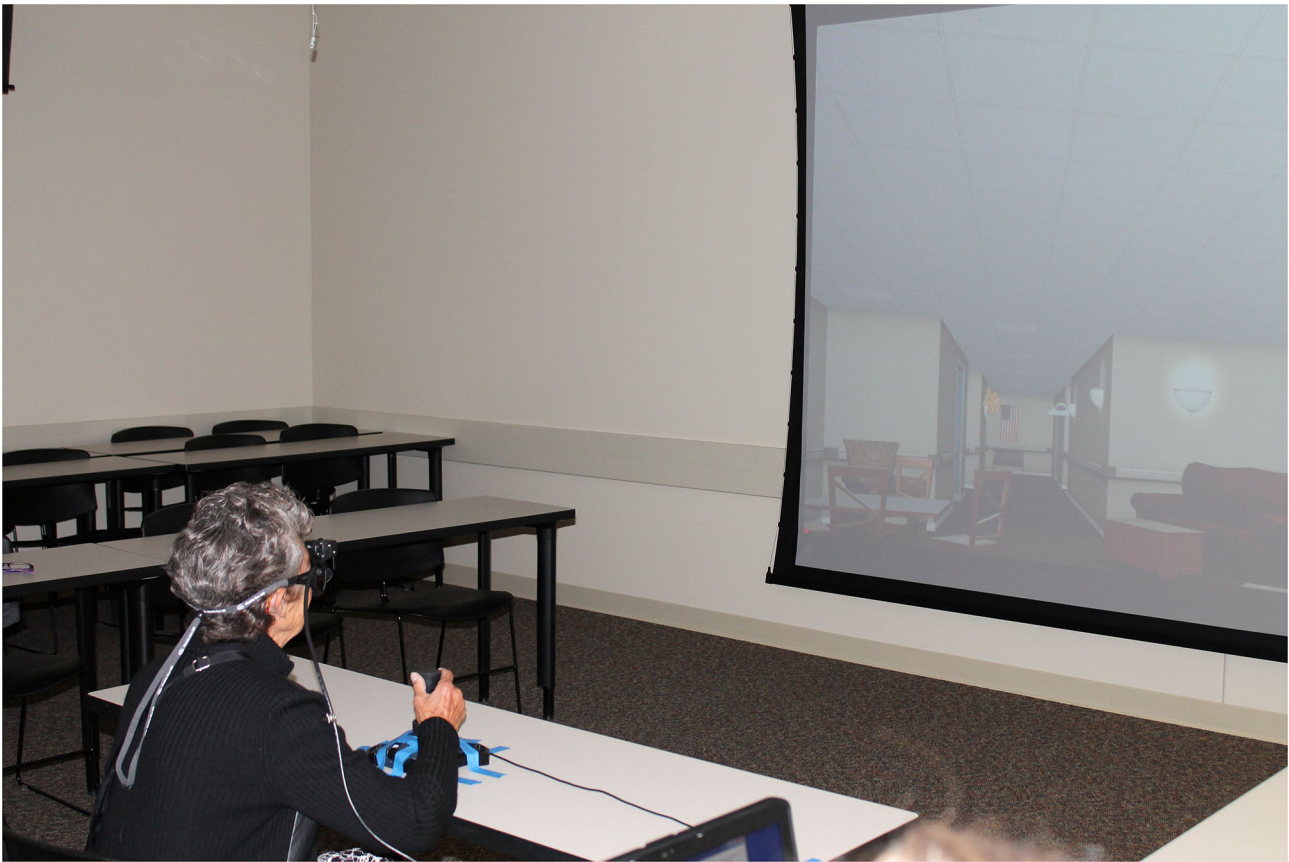
FIGURE 1 | Projected virtual reality spatial navigation test with eye tracking.