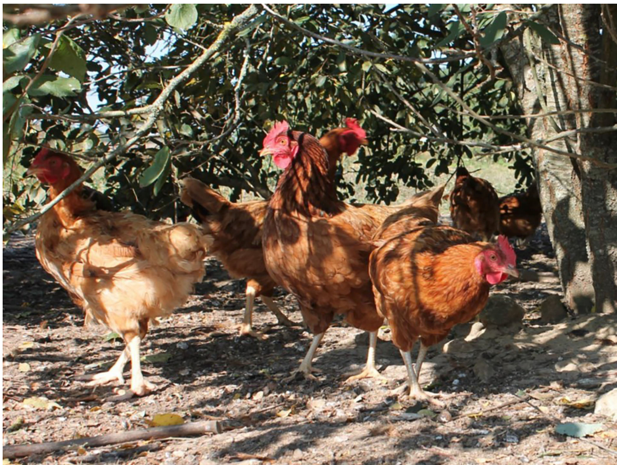
FIGURE 2 Hens under bushes creating a fresh microclimate.

behavior, comfort behavior (resting, dust and sun bathing, wing stretching), feeding behavior (catching snails, insects, eating leaves), running, playing, etc. Moreover, hens using the outdoor area have less plumage damage, indicating less feather pecking (75) and the use of the range has implications on some health variables (8). The use of the range raises many questions since it may not be used enough if it is not attractive enough for the hens or it may get damaged by crowding and intensive use if it is not designed to facilitate the use of the whole range area (76). As a consequence, range use and range management are issues that were mentioned by key informants in each country. Feather pecking was also mentioned as a behavior issue by key informants.