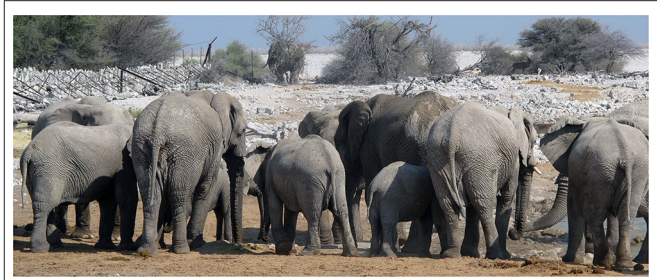
FIGURE 4 | African elephants at waterhole in Etosha National Park, Namibia.

Thompson suggests that through aesthetics, an organism can “ involve itself in the mathematical regularities of the universe ”, citing seasonal changes, cycles of day and night, soundwaves and rhythmical movement as some facets of life on earth that can be represented numerically with accuracy (3). Brando and Buchanan-Smith advocate for animal welfare that takes the patterns of natural life cycles into account (79), while Coe and Hoy (80) argue that abandoning schedules can offer captive animals a kind of relative freedom, allowing for control and self-sufficiency within a population. Captive environments need to be carefully managed, but for a wild animal, there is no such thing as a regular feeding time, for example, although natural activities, such as hunting and foraging, have their own rhythms and chronologies. A tightly managed lifestyle can lead to over-reliance and boredom, potentially contributing to stereotypical behavior.