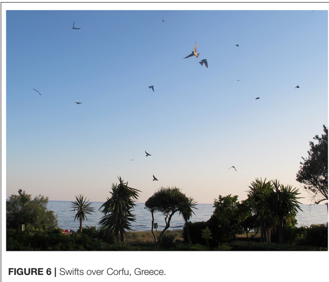
FIGURE 6 | Swifts over Corfu, Greece.

within a system composed of multiple entities that act independently while still maintaining a flow of information between participants (114). The resulting complexity of the system is an emergent property that cannot be predicted by just studying the components as individuals. In Vester Flights (115), Helen Macdonald tells readers: “Turns can propagate through a cloud of birds at speeds approaching 90 miles per hour, making murmurations look from a distance like a single pulsing, living organism.”