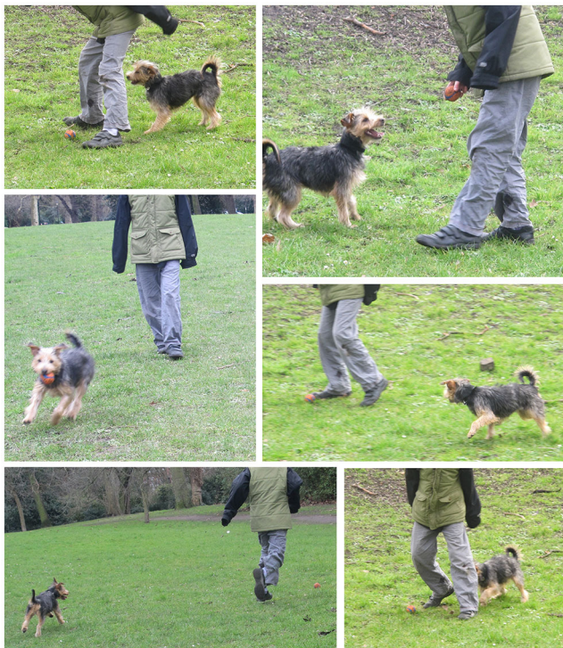
FIGURE 8 | Terrier playing ball with human, London, UK.

might entail stalking, coursing, ambushing or scavenging; killing through disabling and dispatching; eating and subsequently processing (127).