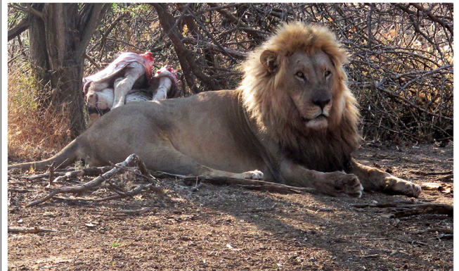
FIGURE 9 | Lion with zebra carcass, Waterberg Plateau Park, Namibia.