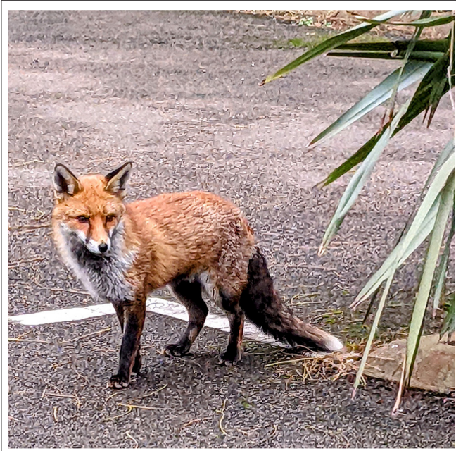
FIGURE 10 | Urban fox in Battersea, UK.