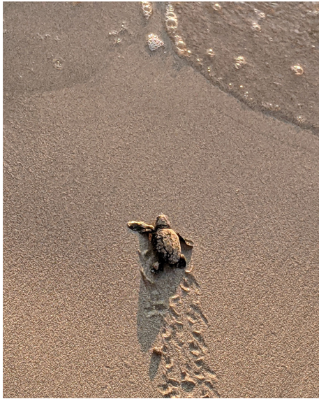
FIGURE 5 | Loggerhead hatchling heading for Mediterranean, Kephallonia, Greece.

of their anatomy with different charges; petal edges and stigma have a high charge, revealing the overall structure of the flower to an approaching insect.