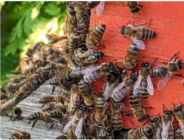
FIGURE 7 | Honeybees in Kent, UK.