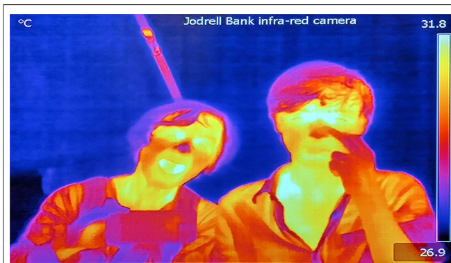
FIGURE 2 | Still from infrared camera at Jodrell Bank, Cheshire, UK.