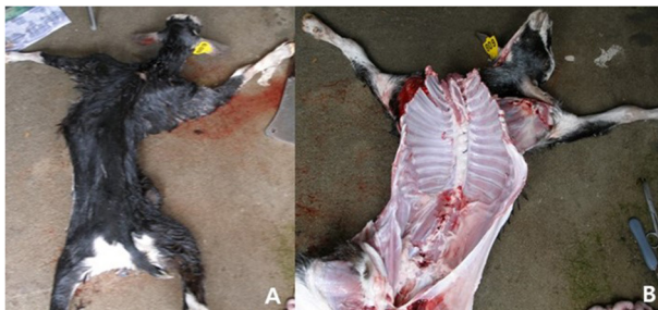
FIGURE 3 | (A,B) Necropsy results. As the necropsy results, we found serious distortion of head and backbone and swelling of joints.

ages, such as kids and 1- to 3-year-old adults. Interestingly, only the goats on the dairy goat farms were PCR positive, and PCR results were negative for six farms that had only Korean native black goats.