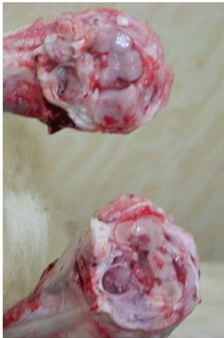
FIGURE 2 | Pathological changes. Swelling and hardness of joint heads, articular cartilage ulceration, severely swollen mesenteric lymph nodes, and fibrinous arthritis were found.