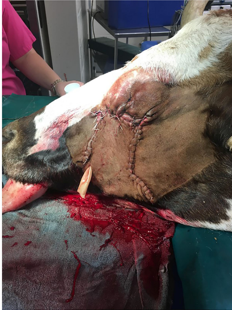
FIGURE 3 | Longhorn cow post-extirpation with sliding H-plasty. Drain placement is in ventral aspect of the incision.

doses. Only 4 of the 7 cases had initial measurements recorded of the lesion size. Of the 4 cases with lesion sizes recorded, 3 of the lesions decreased in size over time; one is currently still receiving therapy. The median duration of therapy was 56.5 days (range: 28–270 days).