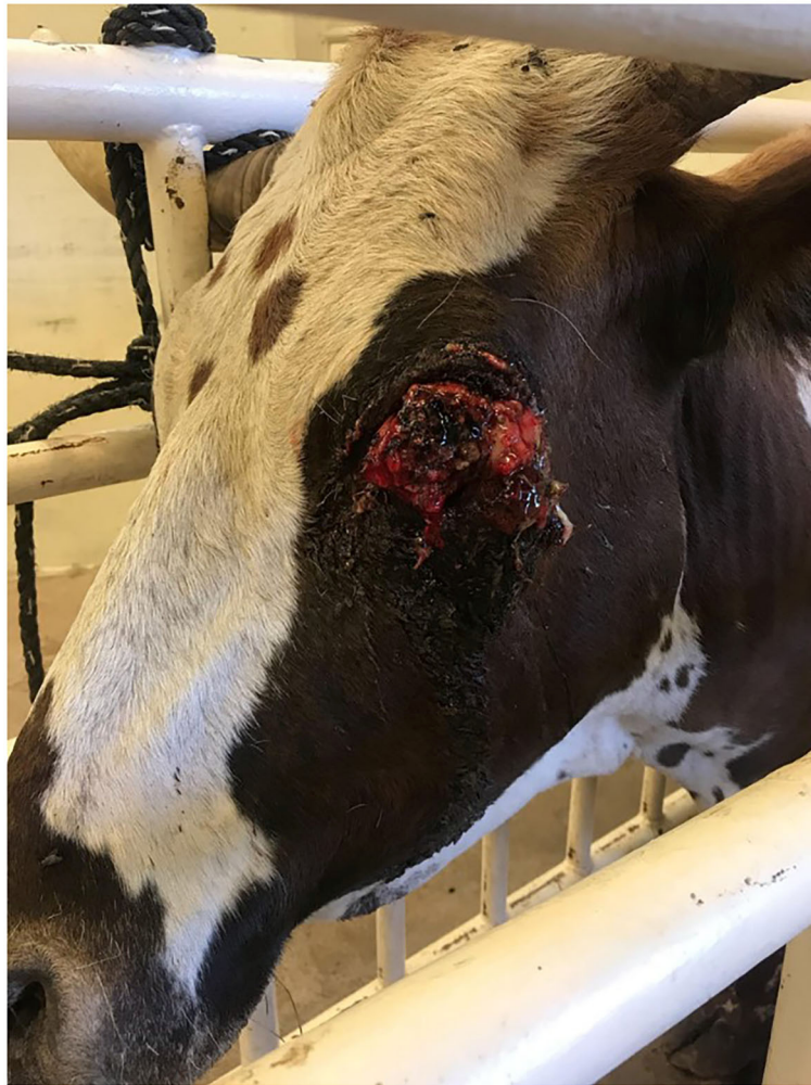
FIGURE 2 | Twelve-year-old Longhorn cow diagnosed with OSCC.

In addition to MCW, surgical therapy and mass debulking were the most common ancillary treatment options. One bull did have cryotherapy performed prior to commencing MCW therapy. The dose of MCW varied from case to case and was based upon the clinician in charge of the case. The bovine patients received only intralesional therapy that was not diluted and administered in a grid-like pattern. The equine patients' dose ranged from 2.5 mL (prepuce lesion) up to 20 mL. This was administered circumferentially around the periphery of the lesion. The caprine patients received both intravenous (0.25 mL diluted in 10 mL) and intralesional (0.25 mL diluted in 3 mL)