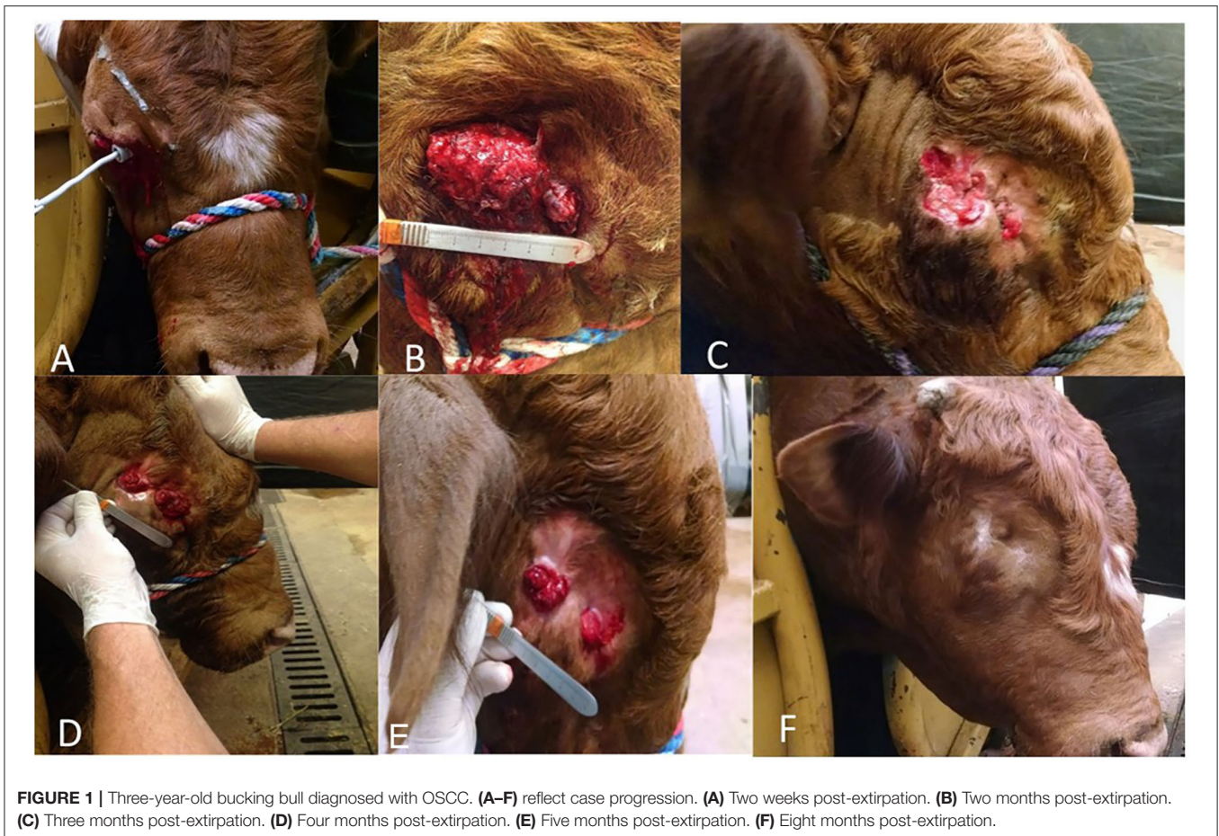
FIGURE 1 | Three-year-old bucking bull diagnosed with OSCC. (A–F) reflect case progression. (A) Two weeks post-excision. (B) Two months post-excision. (C) Three months post-excision. (D) Four months post-excision. (E) Five months post-excision. (F) Eight months post-excision.

excision with clean margins can be curative. Non-resectable lesions are very difficult to manage and treatment modalities for such cases are limited to tertiary referral hospitals. Similar to OSCC in cattle, squamous cell carcinoma (SCC) is the most common malignant skin tumor in horses, comprising 7–37% of them (6). As a frequently diagnosed tumor, SCC has a significant impact on the health and welfare of affected horses (6). The most common treatment option is wide surgical excision of the tumor, which is not always practical or effective (6). In goats, SCC is characterized by its invasive nature and risk factors shared by other species. It is most commonly found on the perineum (7, 8). Studies have suggested other risk factors in goats including a predisposition for females and smaller breed animals (9). Combining surgical treatment with an immunotherapy has the potential to improve the recurrence rate associated with these tumors.