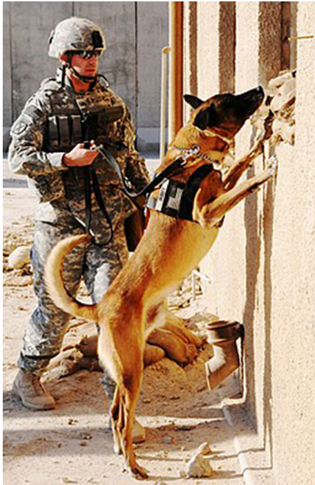
FIGURE 1 | Military dog practicing the “hup” position or standing on its hind legs while forelimbs are resting on a door or vehicle for balance. The ability to perform this task was rated as “excellent” if the dog could remain in position for 8 or more seconds, “good” if holding position for 5–7 s, “fair” if able to hold position for 1–4 s and “poor” if unable to hold for 1 s or less or unable to perform the position (10).