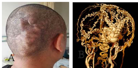
FIGURE 1 Scalp arteriovenous fistula (S-AVF). (A) 41-year-old man presented with a pulsating mass measuring 12 × 7 × 3 cm in size in his right occipital part. (B) CTA shows a complex multiple arteriovenous fistula located in the right occipital scalp and part of the right temporoparietal region, blood was supplied by branches of bilateral external carotid arteries and drained by the right superficial occipital vein.

After analyzing the angio-architecture and size of the S-AVF, we decided to proceed with a comprehensive treatment involving endovascular embolization and surgical removal. Onyx liquid embolic material was successfully injected into the branches of the right occipital arteries supplying the S-AVF. Post-embolization digital subtraction angiography (DSA) revealed partial occlusion of the S-AVF, with the bilateral superficial temporal arteries only faintly contributing to its perfusion (Figure 2C,D). To prevent scalp necrosis, we ceased endovascular treatment at this point. Notably, the mass size was significantly reduced compared to pre-embolization measurements. Following several days of observation, both the temperature and color of the skin returned to normal. Surgical resection was then performed in a prone position under general anesthesia.