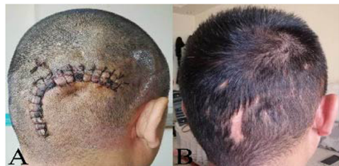
FIGURE 4 The scalp after surgical resection. (A) The surgical incision was dry and clean, and the raised mass disappeared on the third day. (B) After the 12-month follow-up, no recurrence and nothing abnormal was observed, except for lack of hair in part of surgical incision.

The pathophysiology of traumatic S-AVF remains not fully understood. The laceration theory posits that simultaneous laceration of both the artery and the adjacent vein leads to the formation of the fistula (15). An alternative mechanism, known as the disruption theory, suggests that the rupture of the vasa vasorum in the artery wall initiates the process. This rupture leads to the proliferation of endothelial cells from the damaged vasa vasorum, facilitating the formation of numerous small vessels and resulting in vascular communication channels between the artery and vein (1).