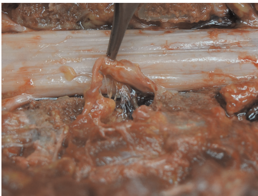
FIGURE 3 MVLs attached to the spinal nerve *—pedicles, which were removed for the visualization of the intervertebral foramen purposes.